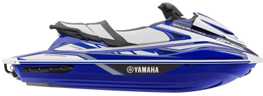
Team Yamaha Blue