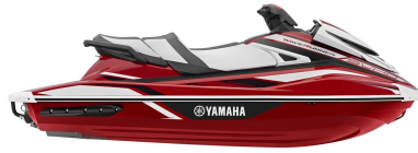
Torch Red Metallic