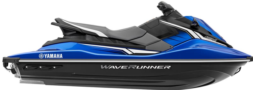
Azure Blue Metallic